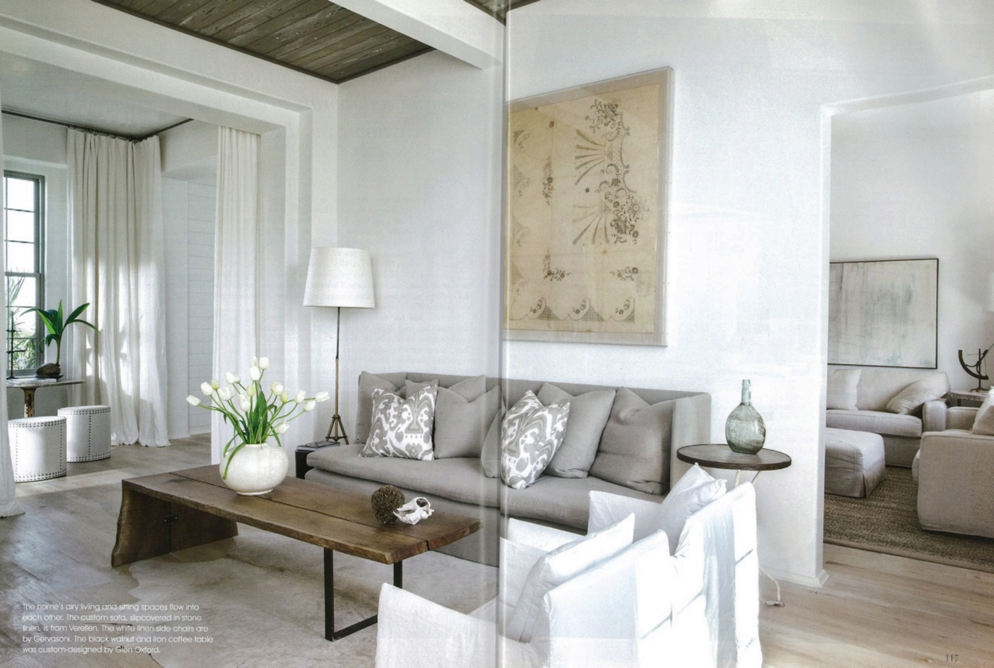
The home's airy living and sitting spaces flow into each other. The custom sofa, slipcovered in stone linen, is from Verellen. The white linen side chairs are by Gervasoni. The black walnut and iron coffee table was custom-designed by Glen Oxford.